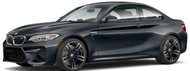
Mineral Grey Metallic