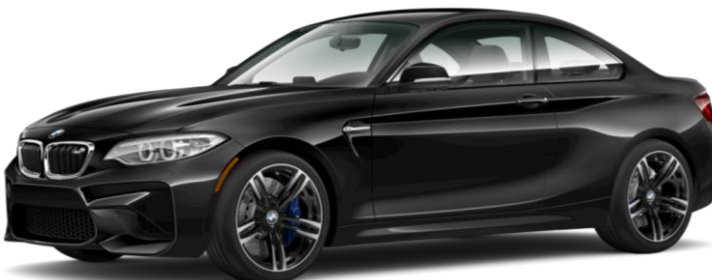
Black Sapphire Metallic