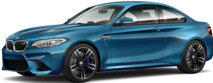
Long Beach Blue Metallic

Positioned in M-exclusive Long Beach Blue Metallic, the all-new M2 is available in three alternative colours: Mineral Grey Metallic, Black Sapphire Metallic, and Alpine White.