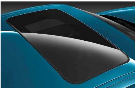
Glass sun roof