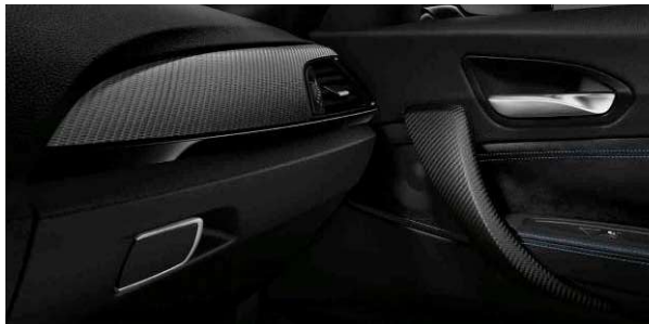
Carbon fibre door trims