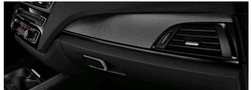
4MC Interior trim 'Carbon Fibre'