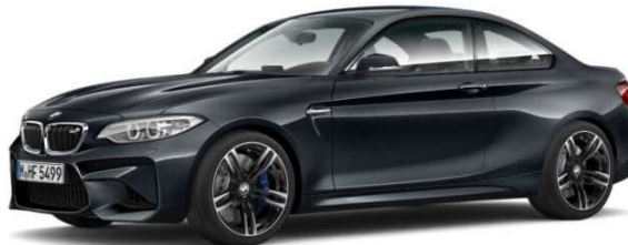
B39 Mineral Grey