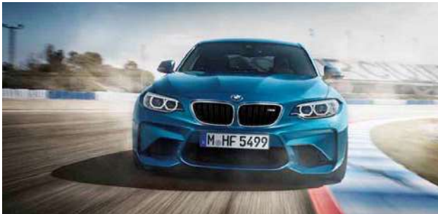
BMW M2 Coupé