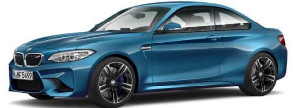
C16 Long Beach Blue