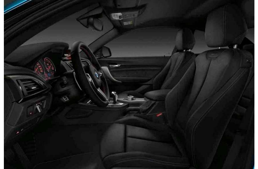
LCNL Leather Dakota Black/contrast stitching Blue | Black