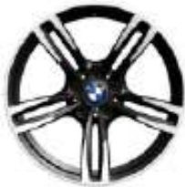
19" styling 437 M, black