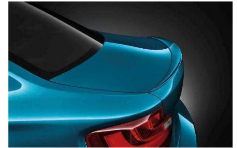
M rear spoiler