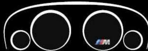
M specific instrument cluster