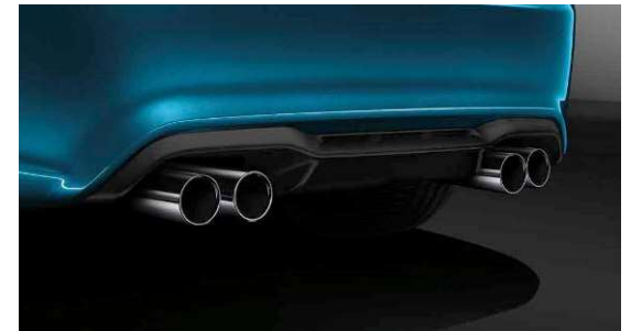
High-gloss double tailpipes