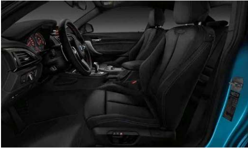
M sport seats