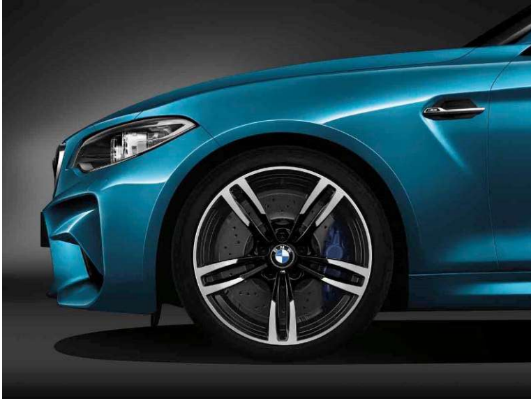
2VZ 19" M-double-spoke style 437 M 245/35 265/35