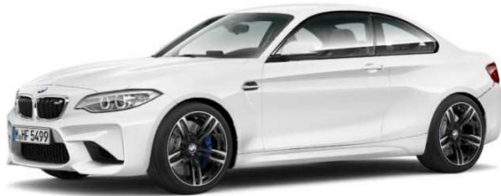
300 Alpine White