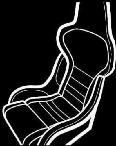
M specific driver's seat

Both exterior and interior design have their M typical design icons , which are absolutely function-orientated and have been refined over decades.