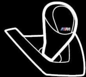
M specific gearshift lever