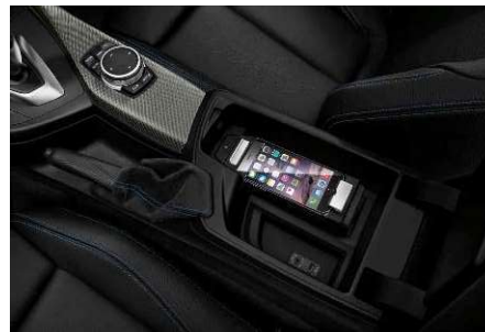
M contrast stitching and Bluetooth hands-free facility