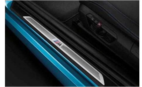
M entry sills