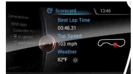
M Laptimer App