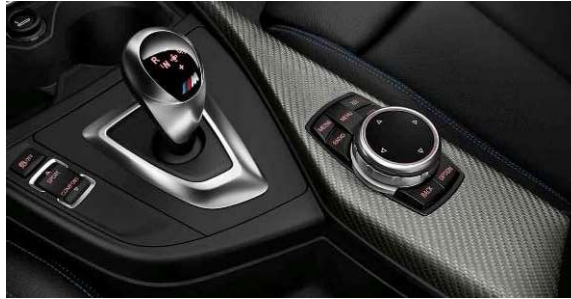
M center console