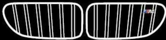
M kidney grille with double slats