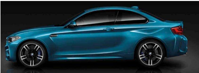
M side skirt