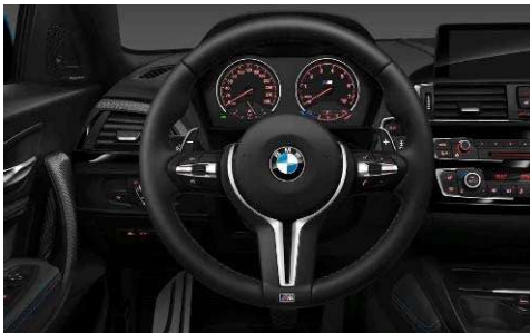
M leather steering wheel