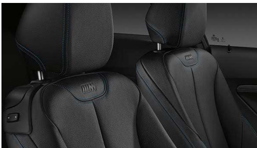
M logo on seats