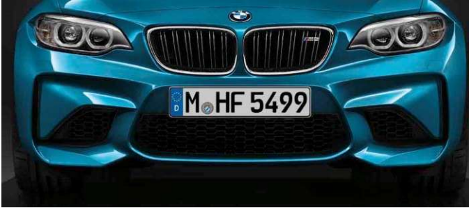
Three part air intake and M kidney grille