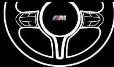
M specific steering wheel