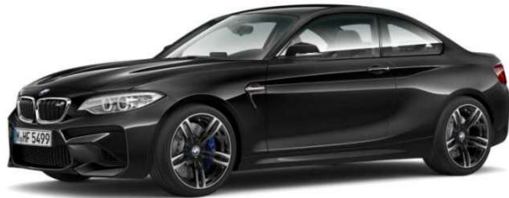
475 Black Sapphire